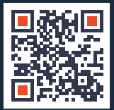
PHOTO SCAN QR or CLICK